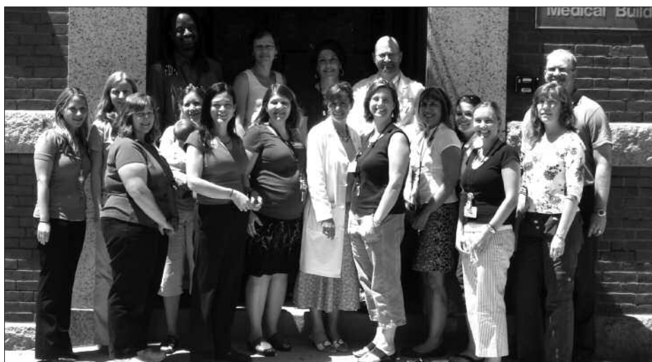
The Division of General Internal Medicine Research Group standing in front of their new headquarters located at 111 Plain Street.